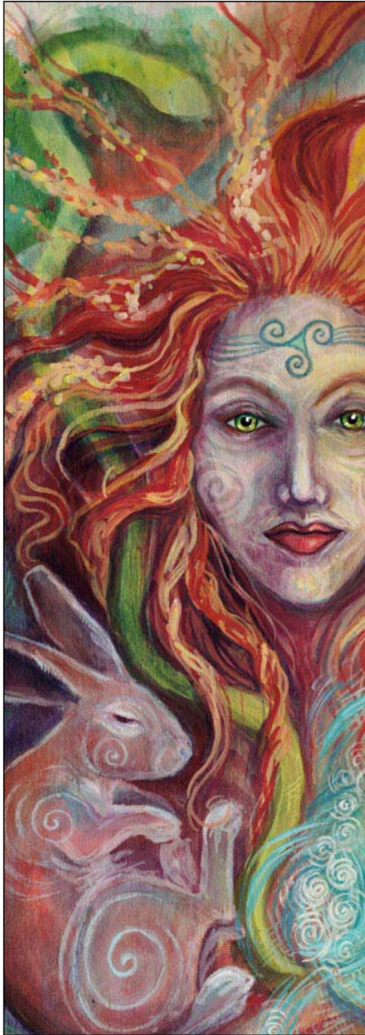
The Flame of Brigid ©2021 Laura Tempest Zackroff