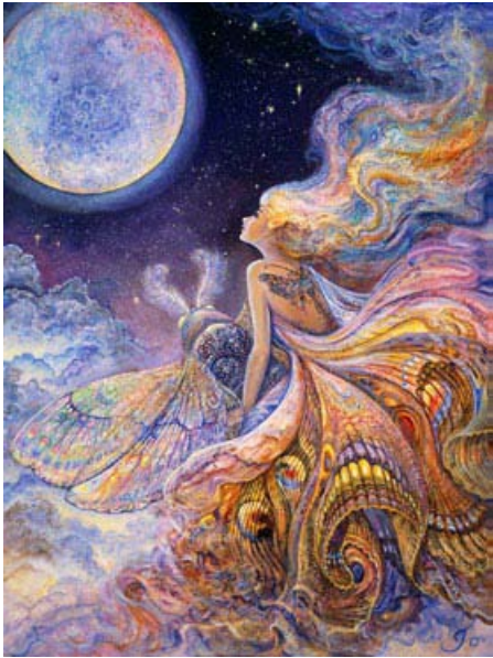
Fly Me to the Moon by Josephine Wall, 2007 (Acrylic on Canvas, 30 x 40) Original art and prints for sale, www.josephinewallgallery.com

"Fly me to the Moon and let me play among the stars..."