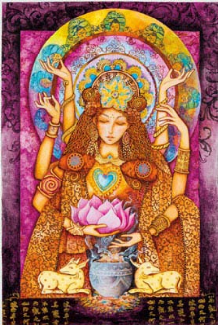
Cover art: "Kuan Yin" © 2015 Holly Sierra www.hollysierra.com