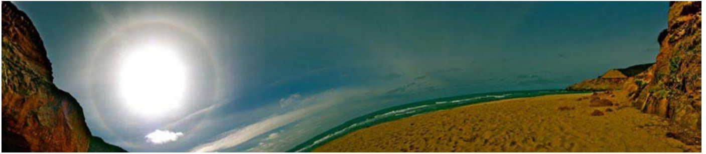
© 2015 SHEKHINA MARGARETTA VON RECKLINGHAUSEN