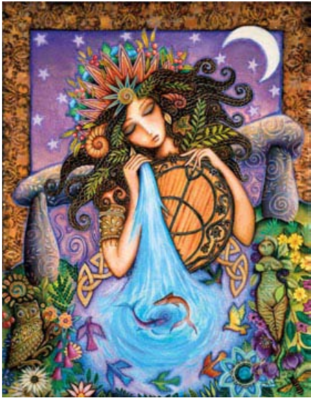
Cover art: “Mistress of the Chalice Well” ©2015 Holly Sierra www.hollysierra.com