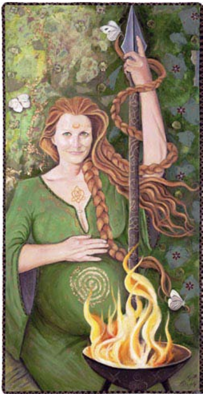
Cover art: “Brighid, Mother Goddess of Ireland” © Jo Jayson 2012 oil and collage on canvas.