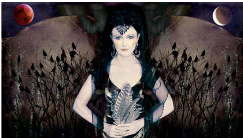
ARTWORK BY NINA PAK