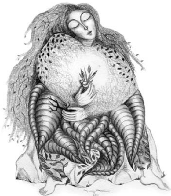
“LADY OF PROTECTION” BY TANYA TORRES

Retreat, like magic, can be made more potent with a physical manifestation. A retreat can take prayer and meditation to the next level with extended time, a change of scenery, and structure and added disciplines such as yoga to focus energy.