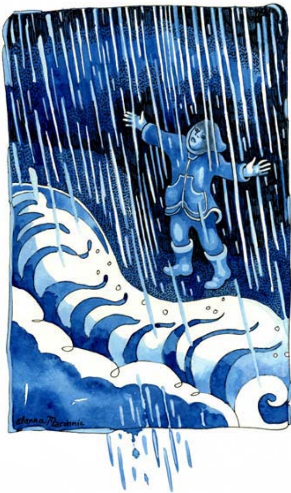
“MOTHER OCEAN” BY ALANNA MAROHNIC

I have to remind myself that nature does not live in the boundaries that we do, in tiny squares we can see in a satellite map of our neighborhoods, but within the vast landscape that we have built our homes upon.